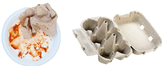
UNCOATED SOILED PAPER