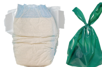
DIAPERS AND PET WASTE