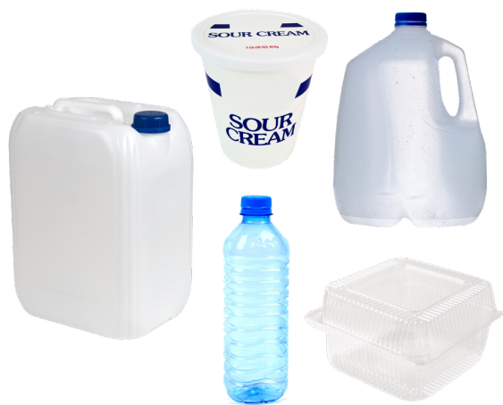
PLASTIC TUBS, JUGS, AND CONTAINERS