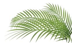
OLEANDERS AND PALM FRONDS

BE ADVISED THAT CONTAMINATION FOUND IN CONTAINERS MAY RESULT IN CONTAMINATION FEES.