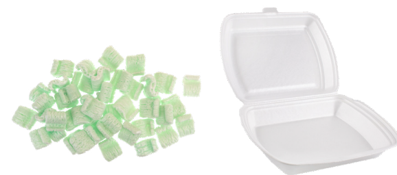
PACKAGING FOAM AND POLYSTYRENE