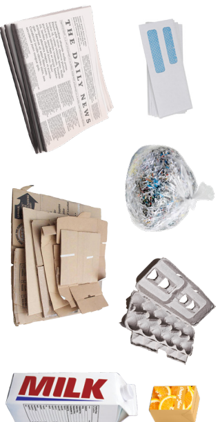
CLEAN PAPER, SHREDED PAPER AND ASEPTIC BOXES (E.G. MILK, JUICE)

Bag shredded paper, or compost it loosely