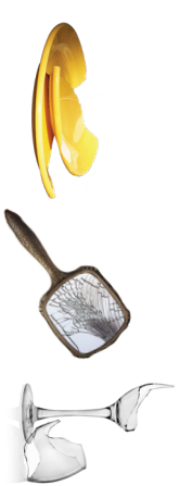
BROKEN CERAMICS, MIRRORS, WINDOW GLASS