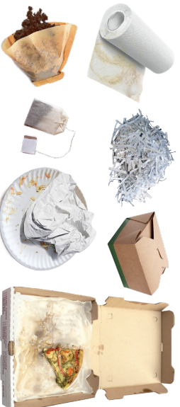
UNCOATED FOOD-SOILED PAPER PRODUCTS