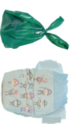
BAGGED ANIMAL WASTE AND DIAPERS