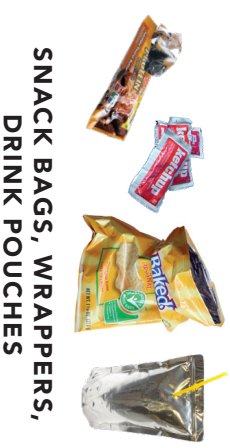
SNACK BAGS, WRAPPERS, DRINK POUCHES