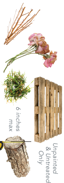
Unpainted & Untreated Only