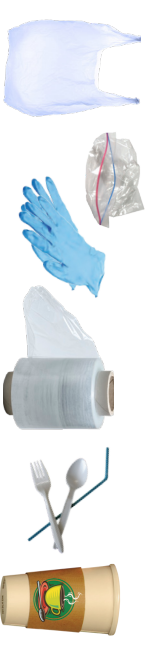
PLASTIC BAGS, FILM AND PLASTIC COATED CUPS