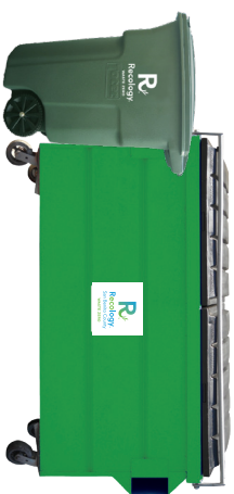
BPI CERTIFIED COMPOSTABLE PRODUCTS