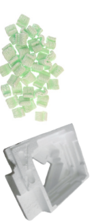
POLYSTYRENE FOAM: PACKAGING, FOOD CONTAINERS, PACKING PEANUTS