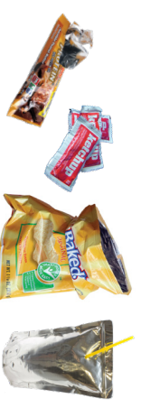
SNACK BAGS, WRAPPERS, DRINK POUCHES