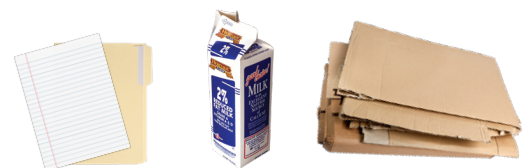
PAPER, FLATTENED CARDBOARD, AND CARTONS PAPEL, CARTÓN PLANO Y CARTONES