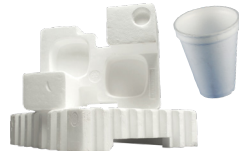
STYROFOAM™ (POLYSTYRENE) PLIESTIRENO

Part of the process of sorting recyclables is done by hand. If a sharp is in the stream of recyclables, it can poke through their glove, potentially causing injury or spreading infection. Sharps must be disposed of as hazardous waste. Parte del proceso de clasificación de los reciclables se realiza a mano. Si hay un objeto afilado en el flujo de materiales reciclables, puede atravesar el guante y causar lesiones o propagar una infección. Deben desecharse como residuos peligrosos.