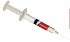
MEDICAL SHARPS OBJETOS PUNZOCORTANTES MÉDICOS

When propane tanks and batteries encounter our equipment, they can cause extremely dangerous fires. They must be disposed of as hazardous waste. Cuando los tanques de propano y las baterías se encuentran con nuestro equipo, pueden causar incendios extremadamente peligrosos. Deben desecharse como residuos peligrosos.