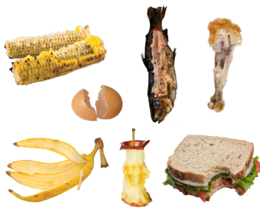
FOOD SCRAPS RESTOS DE COMIDA