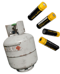
PROPANE TANKS AND BATTERIES TANQUES DE PROPANO Y BATERÍAS