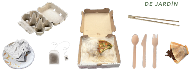
UNCOATED SOILED PAPER AND WOODEN UTENSILS PAPEL SUCIO SIN RECUBRIMIENTO UTENSILIOS DE MADERA