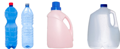
PLASTIC BOTTLES, TUBS, AND JUGS BOTELLAS, BALDES Y JARRAS DE PLÁSTICO