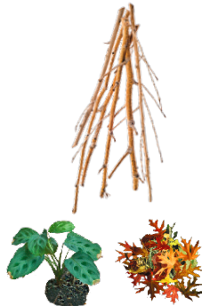
PLANT TRIMMINGS DESECHOS DE JARDÍN