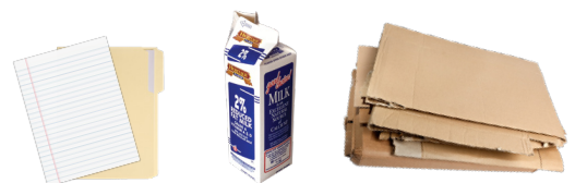
PAPER, FLATTENED CARDBOARD, AND CARTONS PAPEL, CARTÓN PLANO Y CARTONES