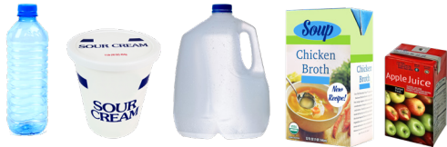
PLASTIC BOTTLES, TUBS AND JUGS (plastic containers #1 – #7 and aseptic containers)

For recycling and reuse options of the materials listed below, please visit San Mateo County RecycleWorks at RecycleWorks.org .