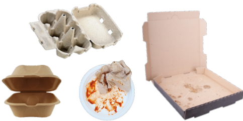
UNCOATED SOILED PAPER