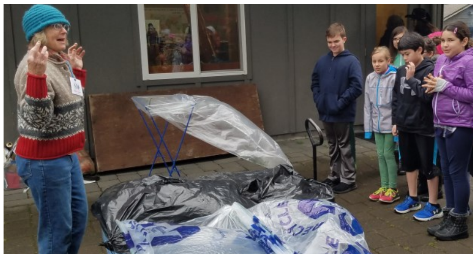
Participating in school events.