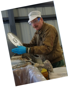
Working on the recycled paint program.

Get involved in a variety of projects in their efforts to raise community awareness and educate others.