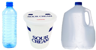
PLASTIC BOTTLES, TUBS, AND JUGS