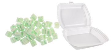
PACKAGING FOAM AND POLYSTYRENE