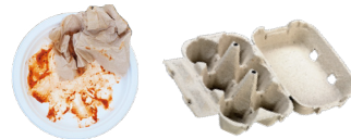
UNCOATED SOILED PAPER