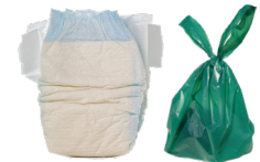
DIAPERS AND PET WASTE