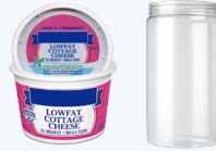
PLASTIC BOTTLES, TUBS, JUGS, AND JARS