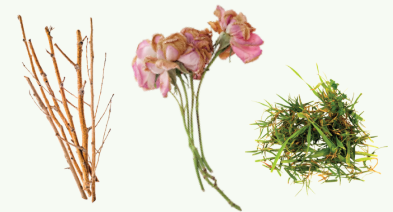
PLANTS AND YARD TRIMMINGS