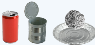
METAL CANS AND LIDS, CLEAN FOIL