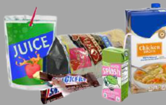
Snack Wrappers, Chip Bags, Juice/Soup Boxes

Put non-recyclable and non-toxic items in the grey container.