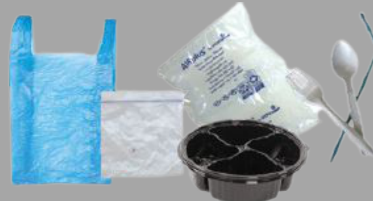
Plastic bags, Film, Cutlery, Straws, Black Plastic