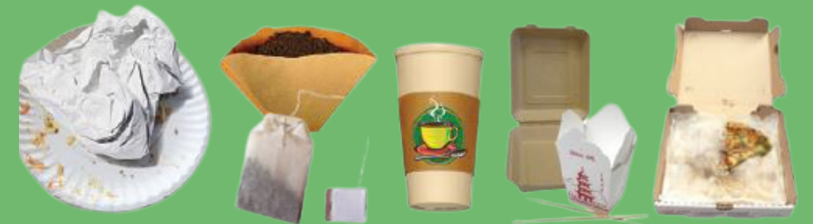
Food & Beverage Soiled Paper