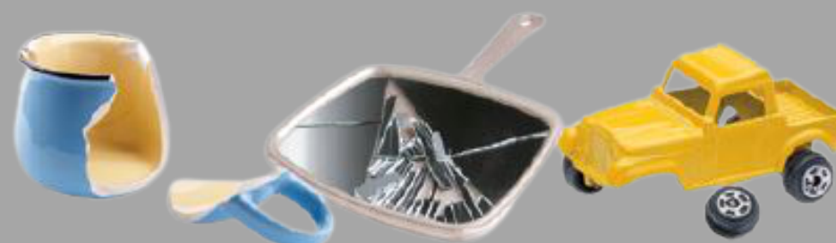
Broken Ceramics, Mirrors, Toys