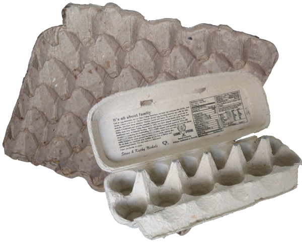
Egg cartons Cartón de huevos 蛋盒