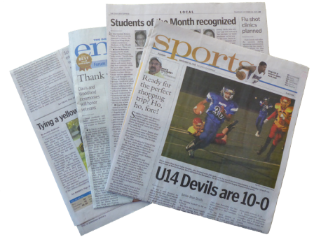
Newspaper Periódico 报纸