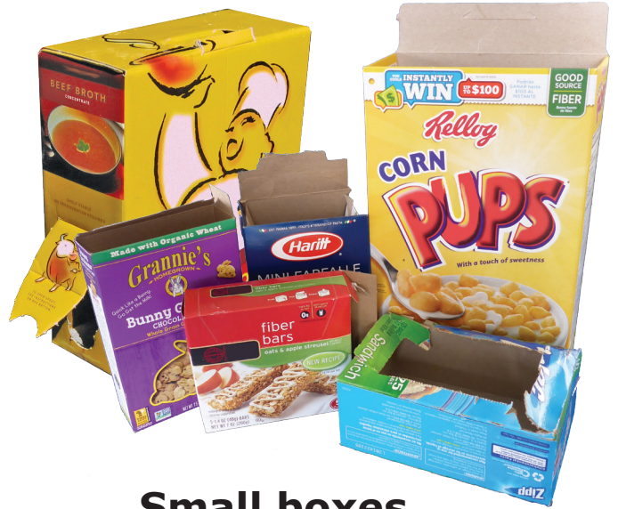
Small boxes Cajas pequeñas de carton 小纸箱