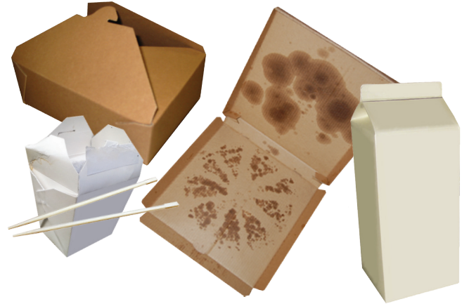
Dirty paper containers Recipientes sucios de papel 被食物污染的紙