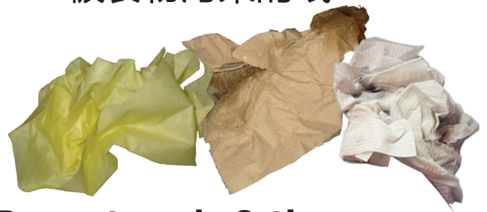
Paper towels & tissues Pañuelos y toallas de papel 擦手紙和紙巾