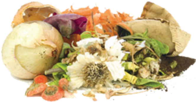
Fruit & vegetables Frutas y vegetales 水果和蔬菜