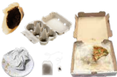
UNCOATED SOILED PAPER PAPEL SUCIO SIN RECUBRIMIENTO