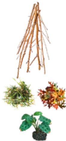
PLANT TRIMMINGS DESECHOS DE JARDÍN