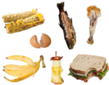
FOOD SCRAPS RESTOS DE COMIDA