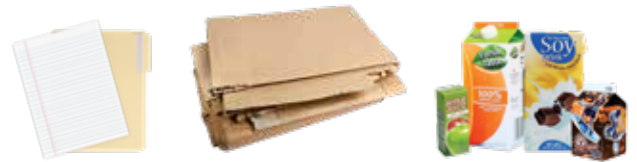
PAPER, FLATTENED CARDBOARD, AND CARTONS PAPEL, CARTÓN PLANO Y CARTONES

Don't know where something goes? ¿No sabes en dónde van las cosas?