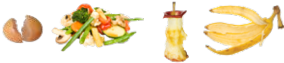
RAW FRUIT & VEGGIE SCRAPS RESTOS DE FRUTAS Y VERDURAS CRUDAS