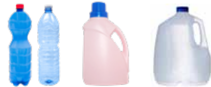
PLASTIC BOTTLES, TUBS, AND JUGS BOTELLAS, BALDES Y JARRAS DE PLÁSTICO