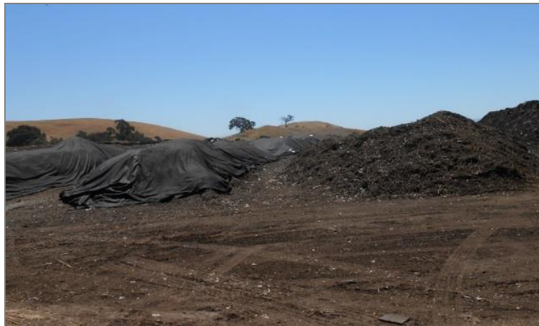
Windrows, 60 - 90 Day Process