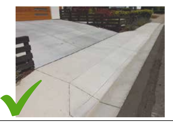
Non-City Standard Driveway Approach - Pavers Encroaching on Public Right-of-Way