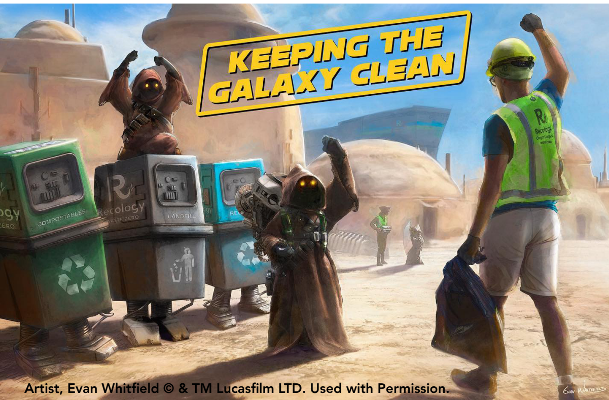
Artist, Evan Whitfield © & TM Lucasfilm LTD. Used with Permission.