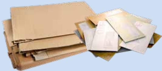
Flattened cardboard, mail, magazines, mixed paper