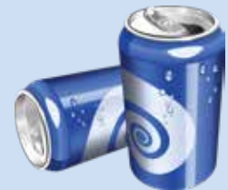
Tin and aluminum cans - NO LIDS