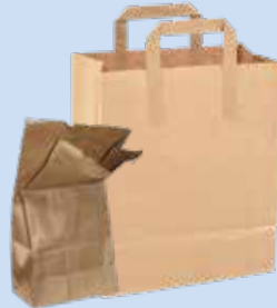
Empty paper bags