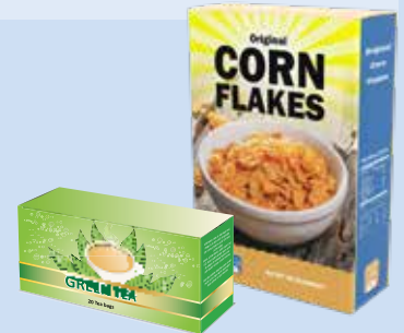
Clean boxes & cartons