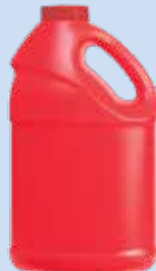
Rigid plastic bottles and tubs - NO LIDS