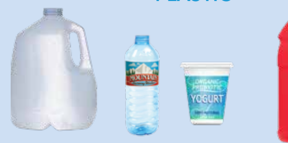
Rigid plastic bottles and tubs - NO LIDS