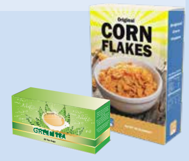
Clean boxes & cartons