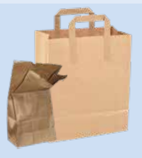
Empty paper bags