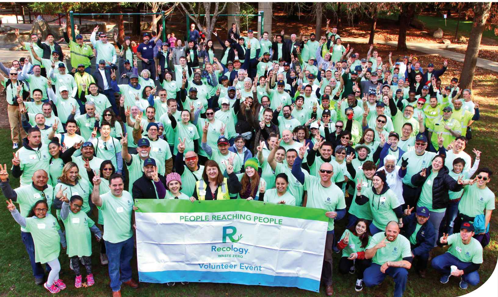
Volunteer event at Howarth Park in Santa Rosa | 12/9/17