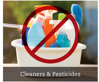
Cleaners & Pesticides

By law, these items DO NOT go into the trash, recycling, or compost bins.