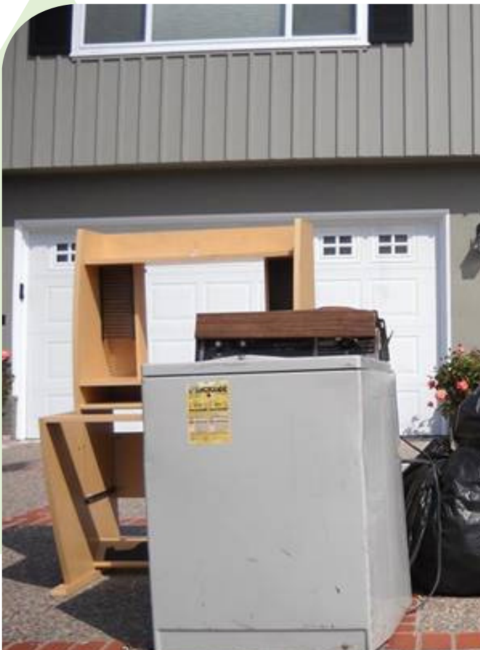
*This service is available for a fee in Cloverdale and Healdsburg

Feel like a VIP and call in a BIP today!