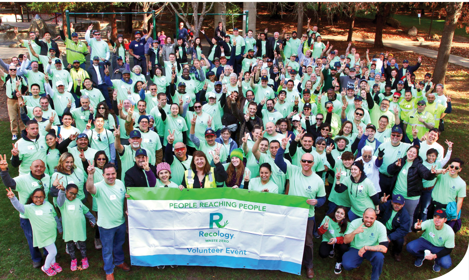
Volunteer event at Howarth Park in Santa Rosa | 12/9/17