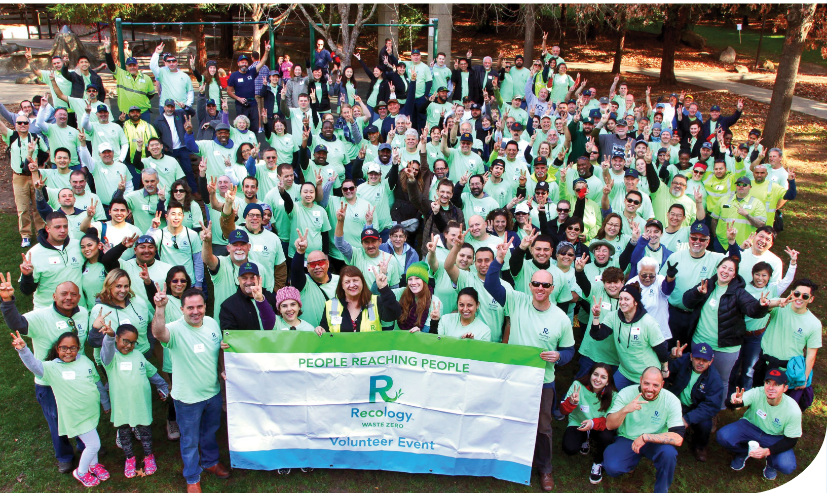
Volunteer event at Howarth Park in Santa Rosa | 12/9/17